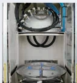
Rotating jig inside the capsule